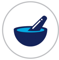
Herbal and Phytoextracts