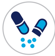
Pellets and Granules