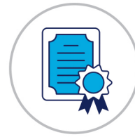
Regulatory Service for Europe Business