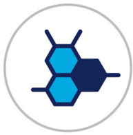
Active Pharmaceutical Ingredients (APIs)